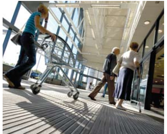
Topguard primary barrier matting