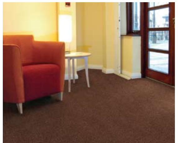
Boulevard 5000 secondary barrier carpet